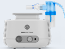
PARI BOY® Classic for use in acute and chronic diseases of the airways of patients aged 4 years and older