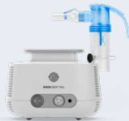
PARI BOY® Pro for use in severe and chronic diseases of the airways of patients aged 4 years and older