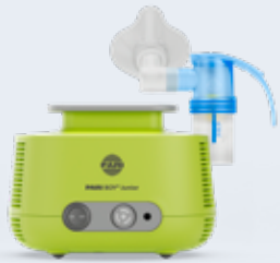
PARI BOY® Junior for babies and small children